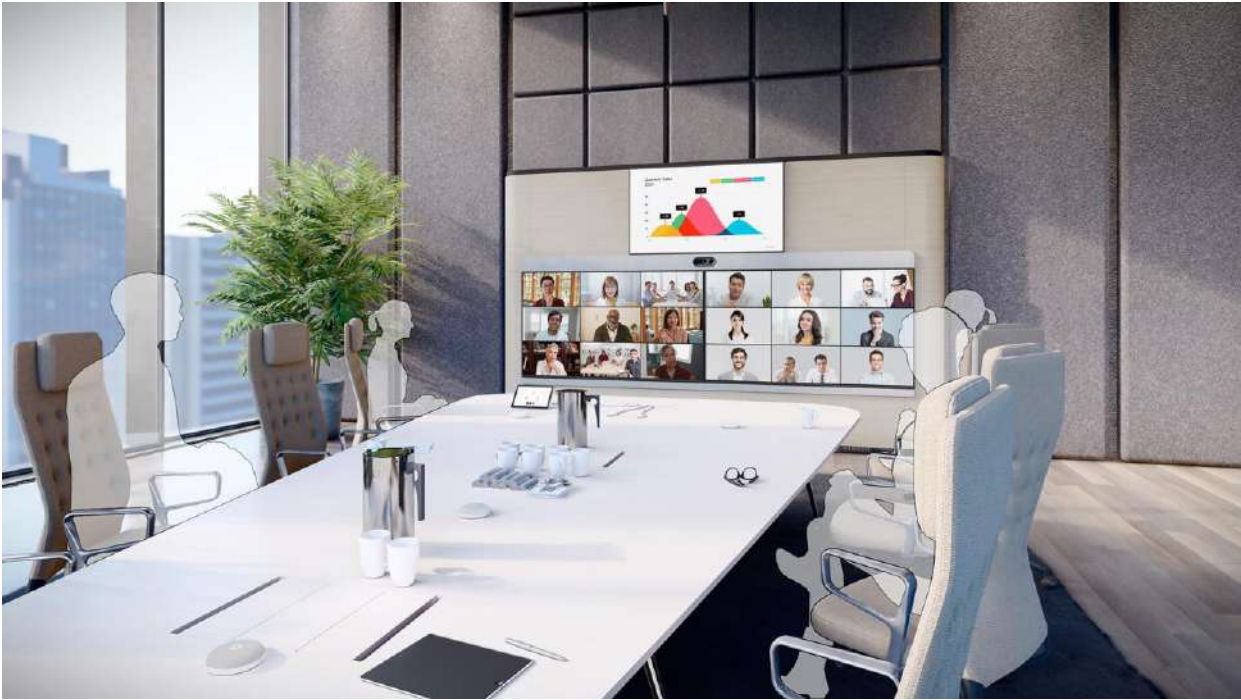
Figure 1. Multi-point meeting in an executive boardroom

The Room Panorama—comprising a powerful codec, a Cisco Quad Camera, dual 82-inch 8K video displays, and a 65-inch 4K presentation display—is ideal for rooms that seat up to 14 people. It offers sophisticated camera technologies that bring panoramic video, directional audio, speaker-tracking, and auto-framing capabilities to medium to large-sized rooms. The product is rich in functionality and experience and designed to be easily scalable to all your large conference rooms and spaces, whether registered on the premises or to the Webex cloud service.