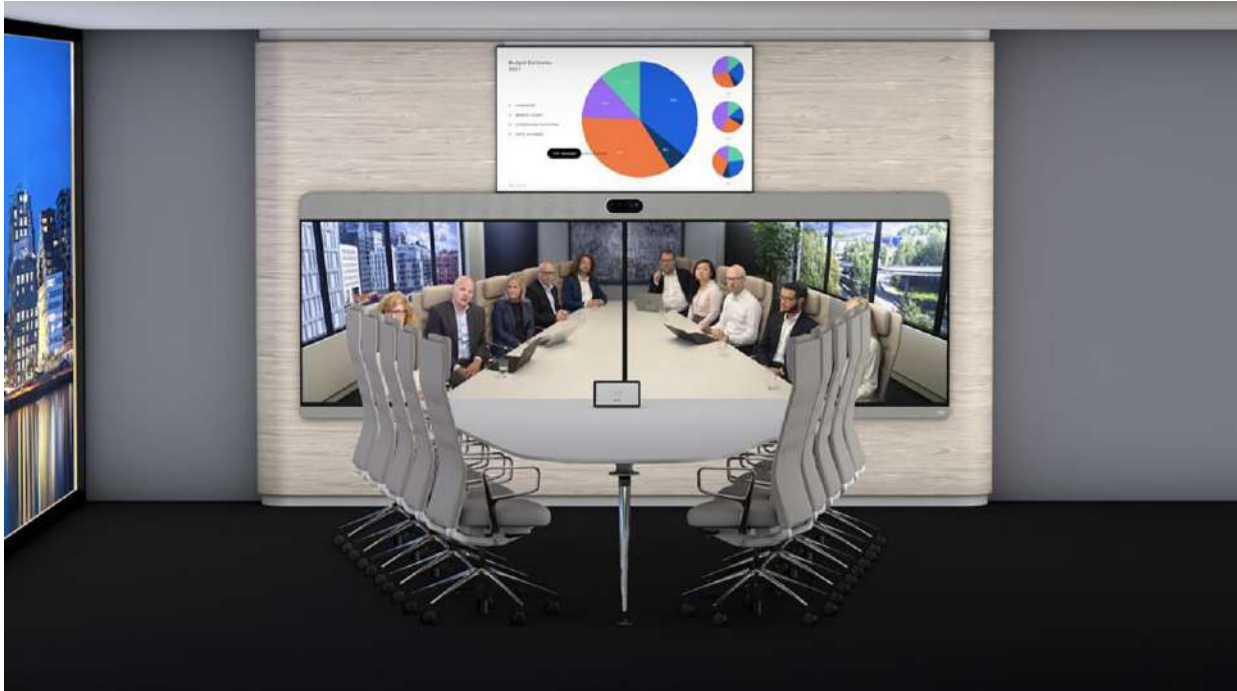
Figure 2. Point-to-point meeting in a large conference room